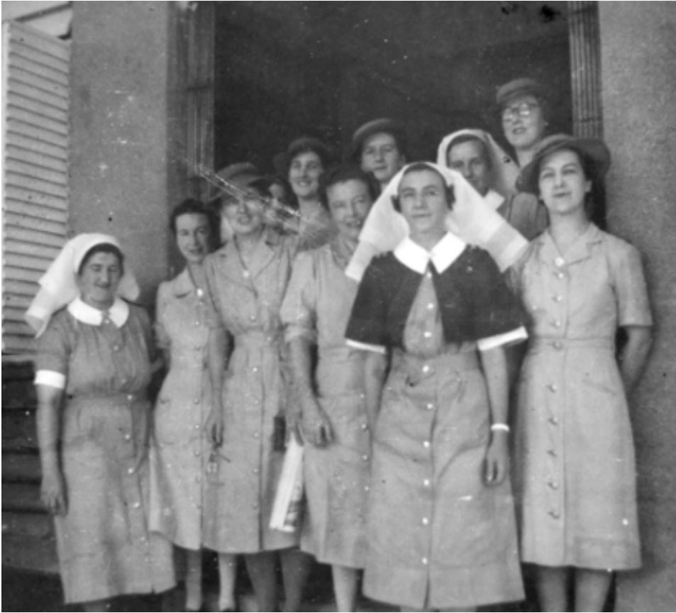
Colonial nurses in Malaya, World War II.